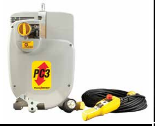
Robust remote control system