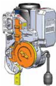
3. Rotate the sheave back in and close the access doors.