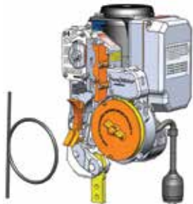
2. Insert wire rope.