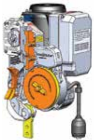
1. Open access doors and retract sheave.